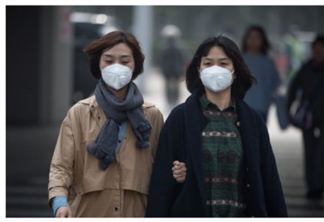
At least three suspected cases are being treatigated in Shandhan and Shanghal, sources say

Jan 18 - When the government said there was no mainland case outside Wuhan and no human to human transmissions