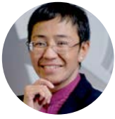
Maria A. Ressa CEO and Executive Editor Rappler Philippines